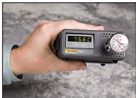
Take the 9100S anywhere. It's the smallest dry-well in the world.

Since we introduced the world's first truly handheld dry-well, many have tried to duplicate it. Despite its small size (57 mm [2¼ in] high and 127 mm [5 in] wide) and light weight, the 9100S outperforms every dry-well in its class in the world.