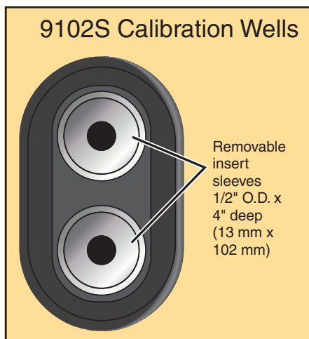
9102S block configuration. Instrument includes 1/4" and 3/16" inserts. Order additional sizes as needed.