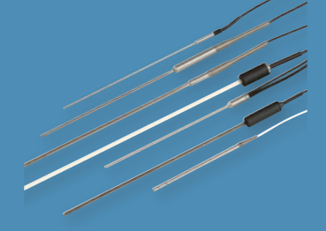
Calibrated Temperature Sensors