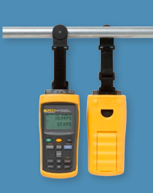
TPAK Magnetic Hanger