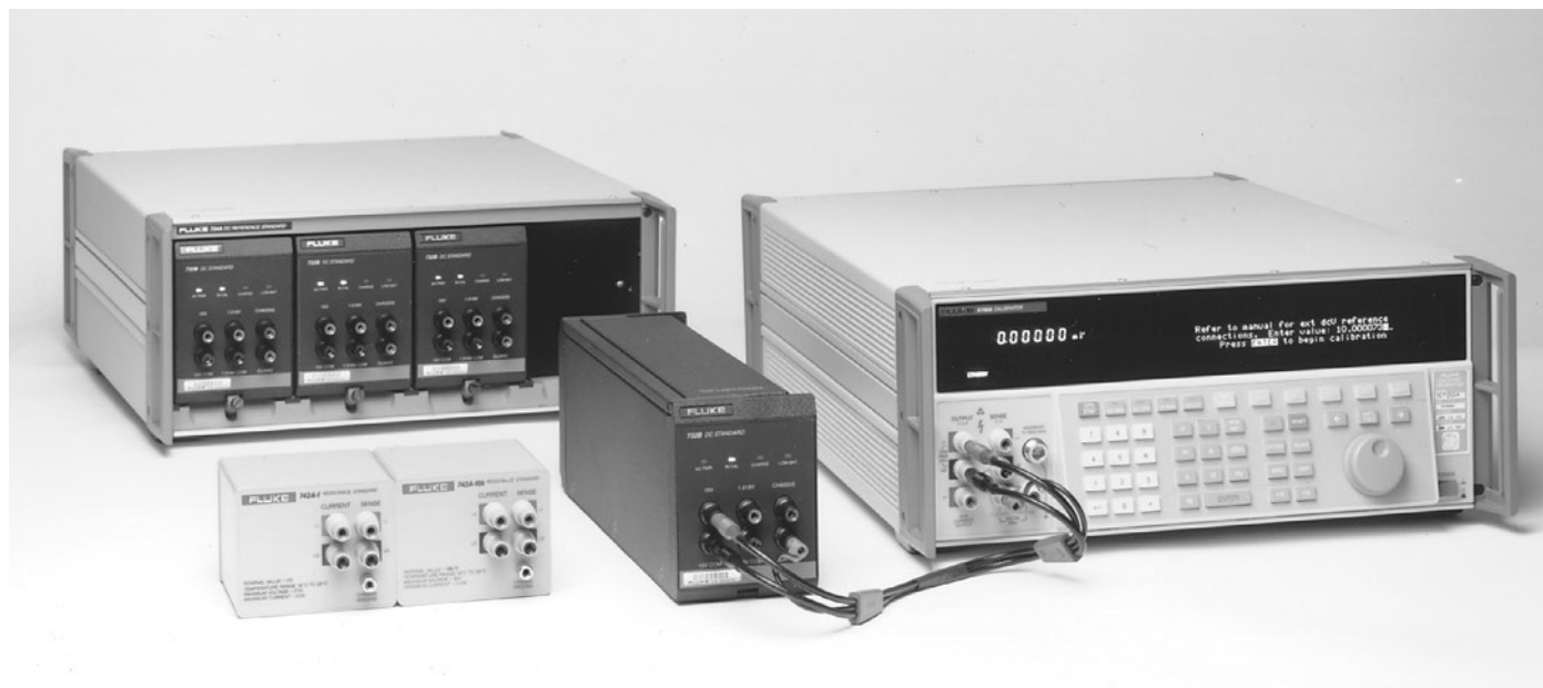
The 734A Reference and 732B Standards are a practical way to maintain and disseminate your volt and to support artifact calibration of instruments like the 5700A and 5720A Calibrators.

The 732B’s reference amplifier and resistors are identical to those used in the 732A. But the package is now half the weight, 75 % smaller, more rugged and offers greatly extended battery life. The rack-width enclosure provides a convenient way to store cells in your lab. And the internal battery is now a common, off-the-shelf model that can be purchased from a wide range of electronic components suppliers, simplifying your support. Or you can use your own battery, connecting it to the 12 V to 15 V dc input on each 732B.