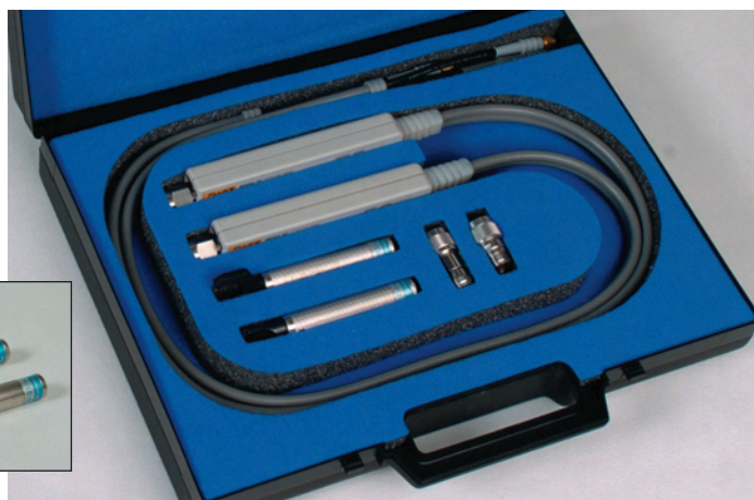
Adapters and torque wrench kit as supplied with 96XXCONN