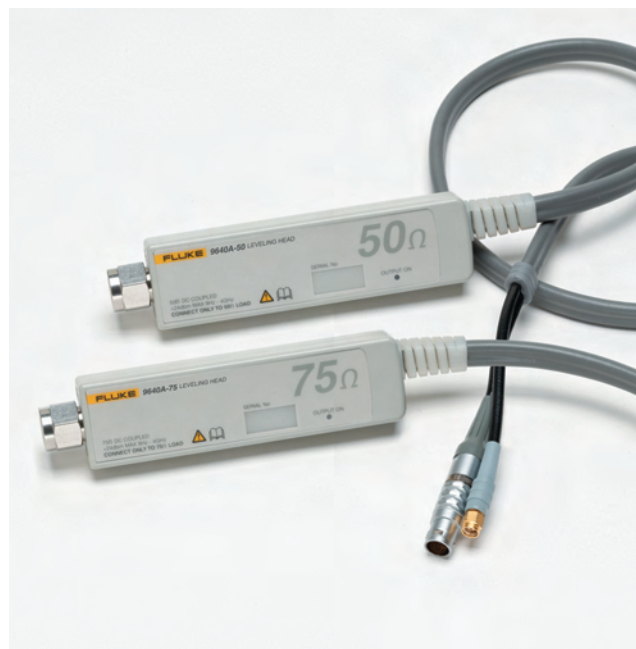
The 9640A system includes a 50 Ohm or optional 75 Ohm precision leveling head. The head delivers fully floating signals directly to the UUT to ensure the accuracy and integrity of the reference source output signals at the device under test input.

The importance of interconnections in measurement work should never be underestimated. Replacing a connector may significantly reduce the uncertainty contribution in a measurement process. When choosing a connector, careful consideration must be given to select the correct connector for the measurement task. In modern RF instruments, such as signal generators and spectrum analyzers, the coaxial connector socket on the front panel is often an integral part of a complex subassembly and any damage to this connector may result in a very expensive repair.